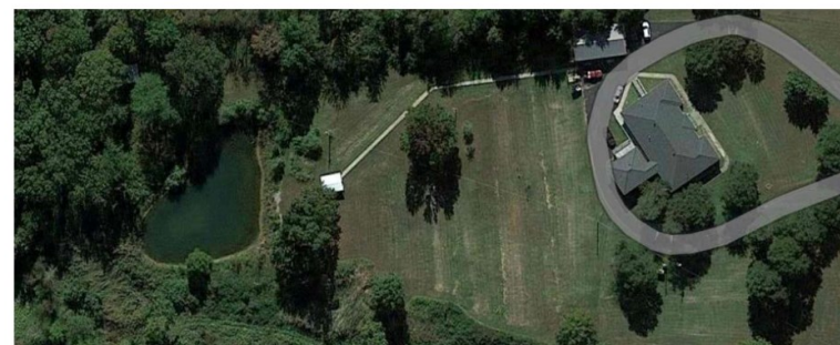
(A beautiful sky view shot of Dyball's Campus).

We firmly believe that every challenge presents an opportunity for growth and learning. As we navigate this stage, we invite you, our friends, to lend your support, ideas, and expertise in helping us uncover a new and meaningful purpose for the Dyball Home.