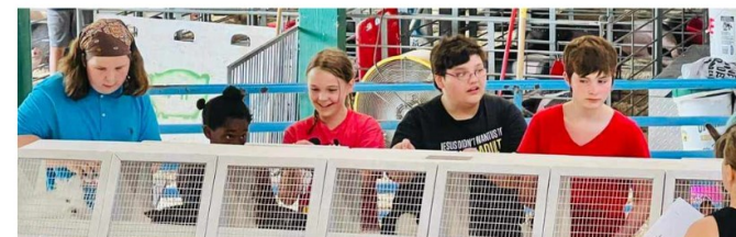
FIRST 4-H SHOW FOR OUR YOUTH EVER