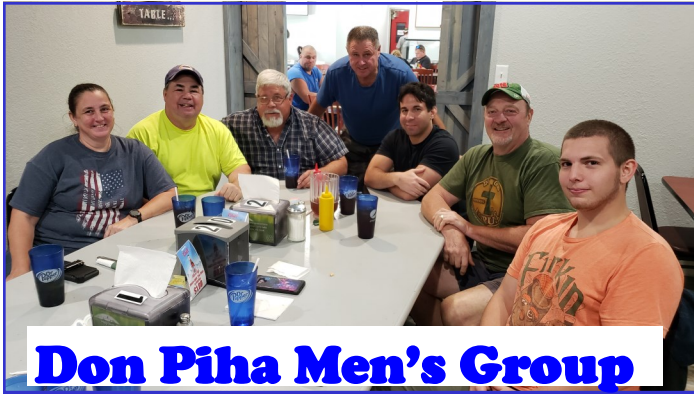
Don Piha Men's Group

One of the ways churches and ministries can help us is through work groups! It's a great way to maintain our ever-growing campus as well as having some really fun fellowship! Recently we hosted a few groups.