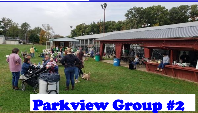
Parkview Group #2