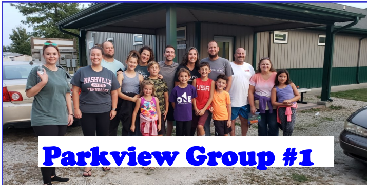
Parkview Group #1

Thanks to all the volunteers at the Parkview New Lenox Group for removing several dead trees behind the Talitha Koum home, they even built a wall for the transitional living unit. (We now have another room.) The second group came back to finish the work and even helped us with our fundraisers!