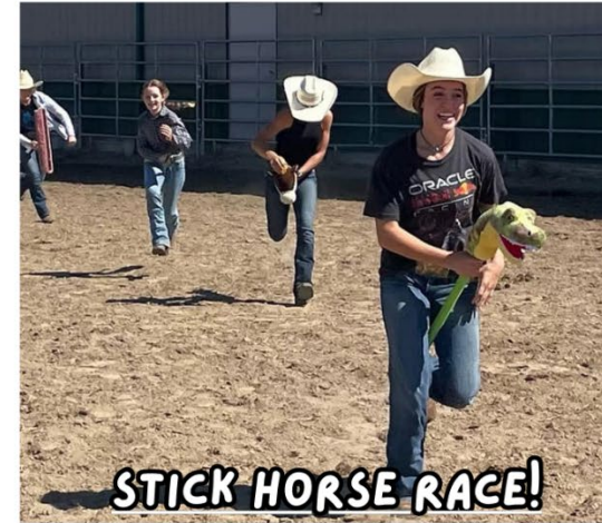
STICK HORSE RACE!

The "Hold Your Horses" event was a blast! Our stick horse racing and pony show brought endless laughter and joy to everyone involved. Thank you to all participants and supporters for making this day unforgettable for our kids and community!