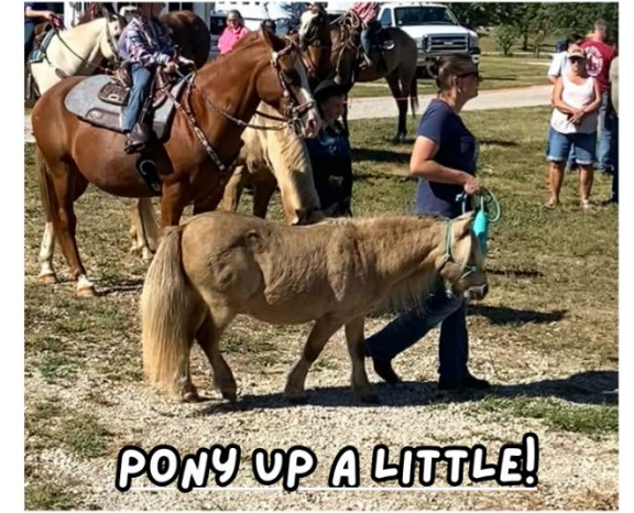
PONY UP A LITTLE!